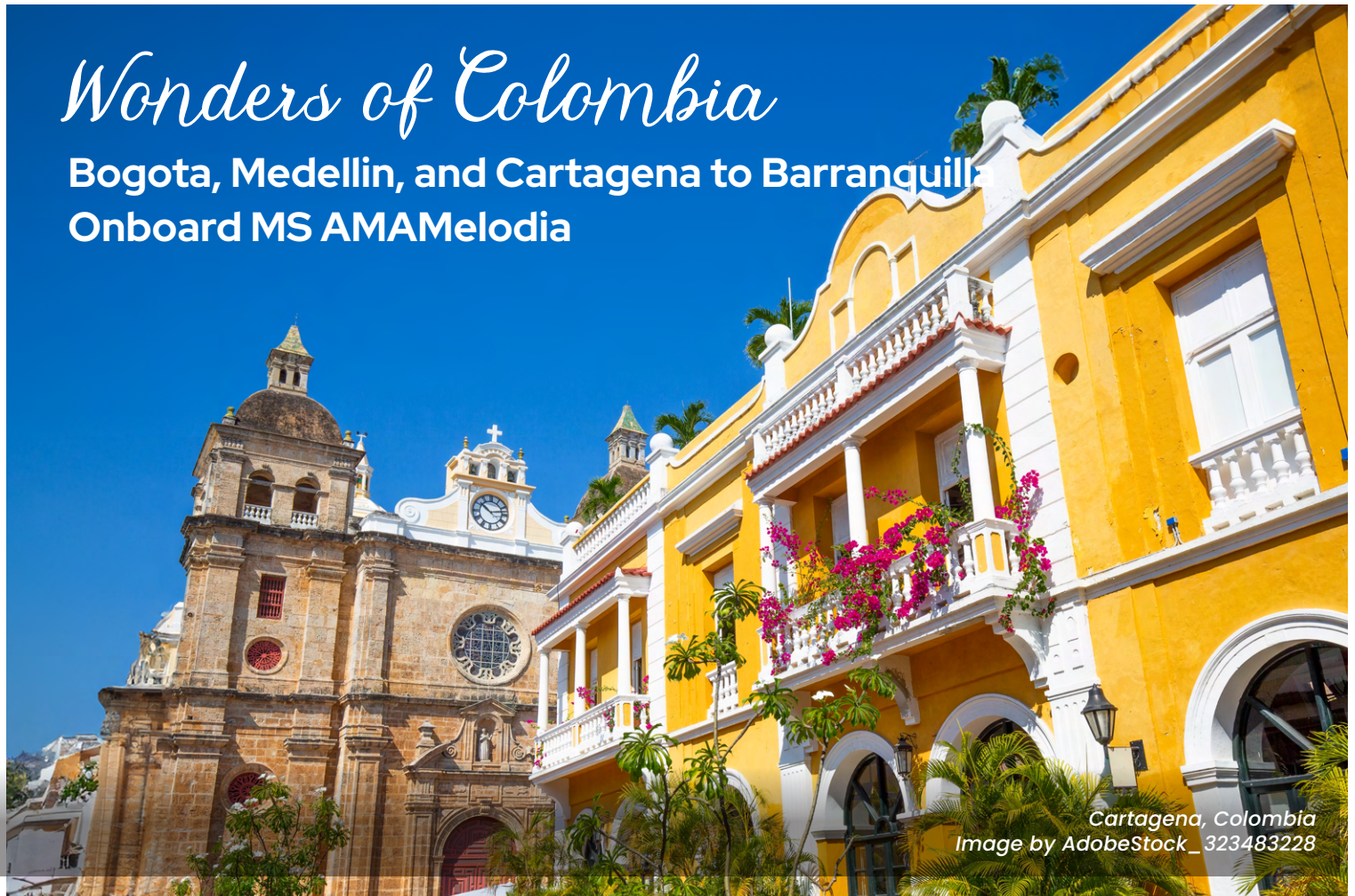
Cartagena, Colombia

Bogota, Medellin, and Cartagena to Barranquilla Onboard MS AMAMelodia